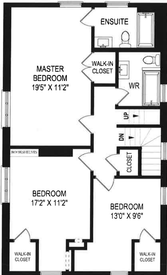
SECOND FLOOR 878 SQUARE FEET