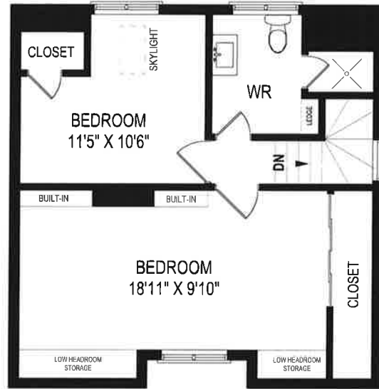
THIRD FLOOR 534 SQUARE FEET