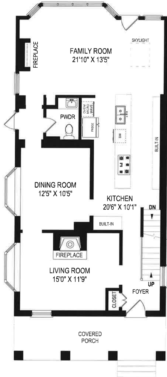
MAIN FLOOR 1070 SQUARE FEET