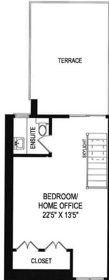
THIRD FLOOR 352 SQUARE FEET CEILING HEIGHT 8'7"